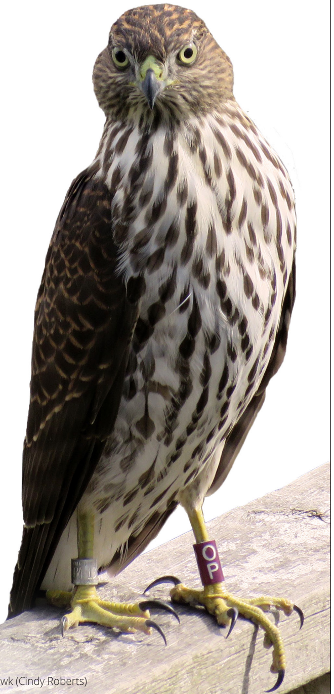
Juvenile Cooper's hawk

Here's to a prosperous 2020 for all of you and for our urban raptors!